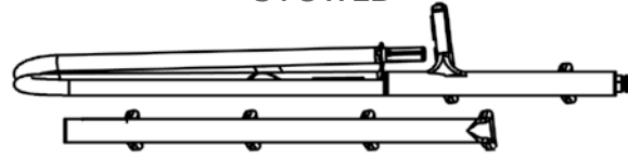
LADDER SPLITS FOR STORAGE