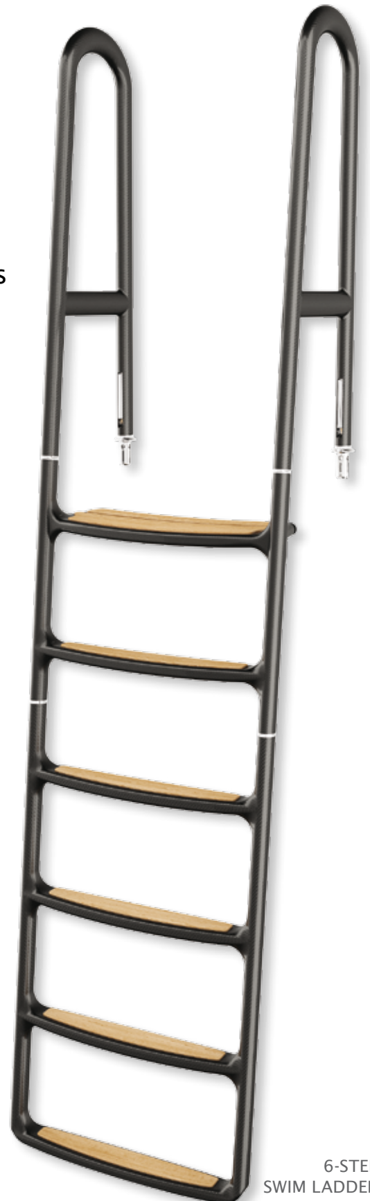
6-STEP SWIM LADDER